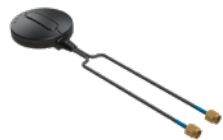
ME-A-4-GGC GPS/GLONASS & 2G 3G

GNSS & LTE frequency bands / Magnet Mount / SMA connector / 51.4 x (h) 11.7 mm / Comes with High Grade 3M Double Sided/1m cable length RG-174