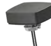
ME-LGI-SM 3in1 antenna Screw Mount External (Cellular/LTE, ISM & GNSS Antenna)

Frequency ranges: 915MHz frequencies /Screw mount/ Low profile: Ø 48 x 82 mm/SMA connector / Rated IP67/3m cable length RG58U