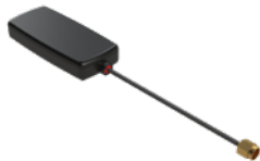
ME-2490-AM 2.4/5.0/6.0 GHz ISM Adhesive Mount

2.4/5.0 GHz & ISM bands / Easy Mounting / Low profile: 80 x 76 x 13 mm / IP67