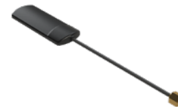
ME-2490-VM 2.4/5.0 GHz ISM Velcro/Adhesive Mount

2.4/5.0/6.0 GHz ISM Band/ Ground Plane Independent/ Customizable Cable and Connector